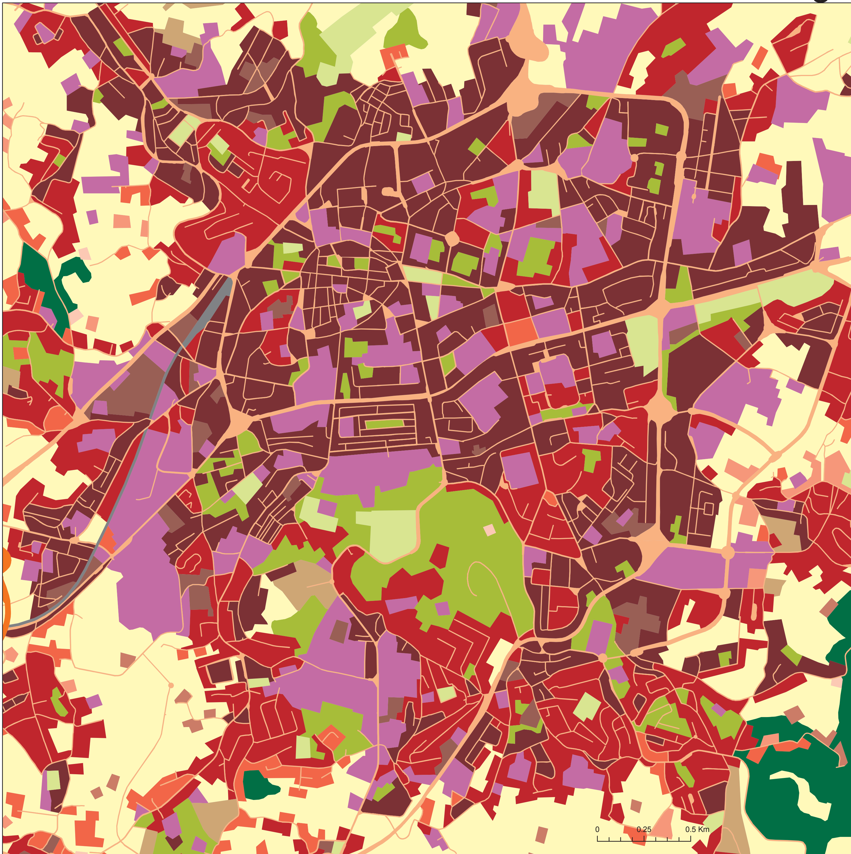
Larger Urban Zone: Braga