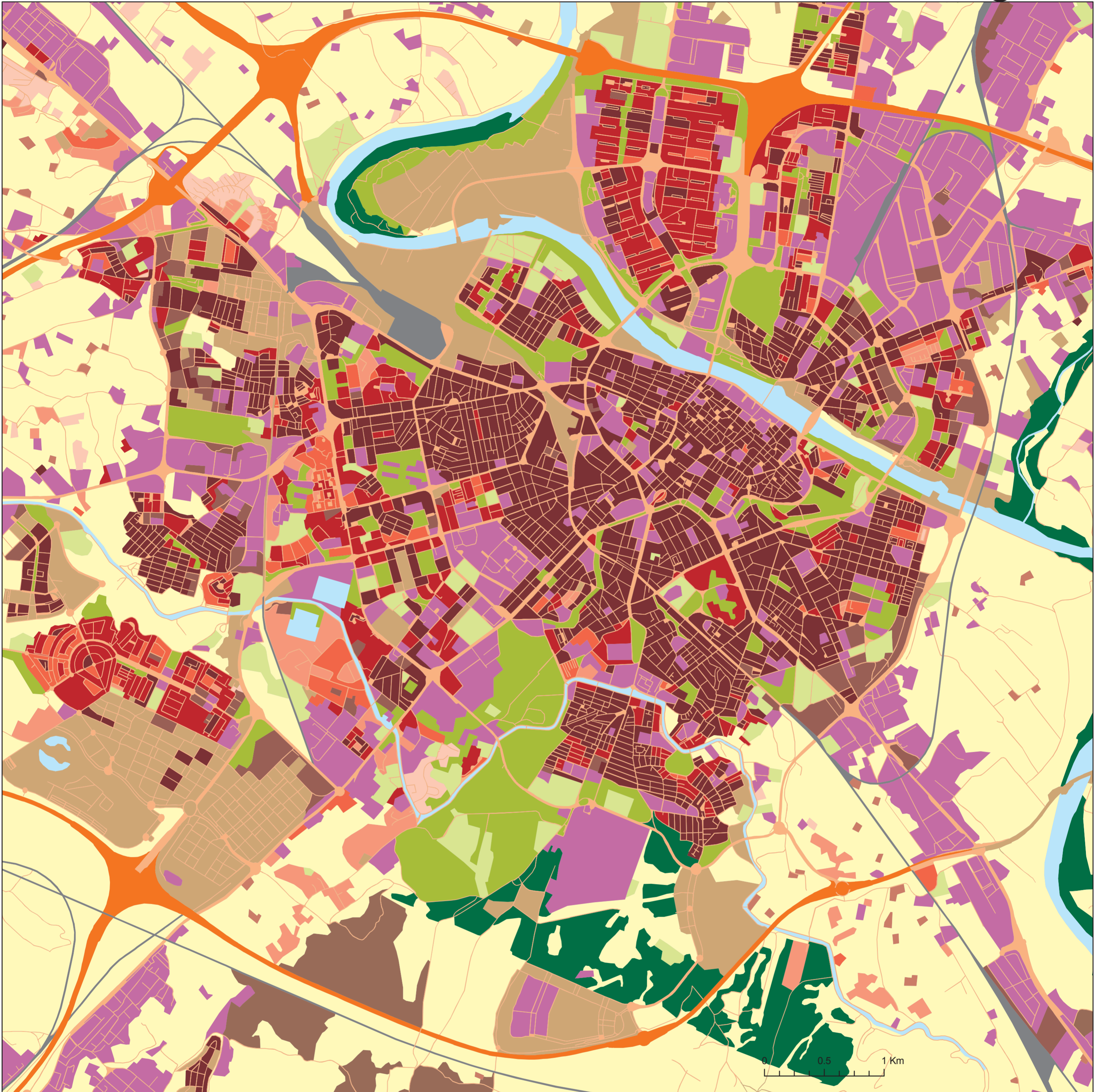
Larger Urban Zone: Zaragoza