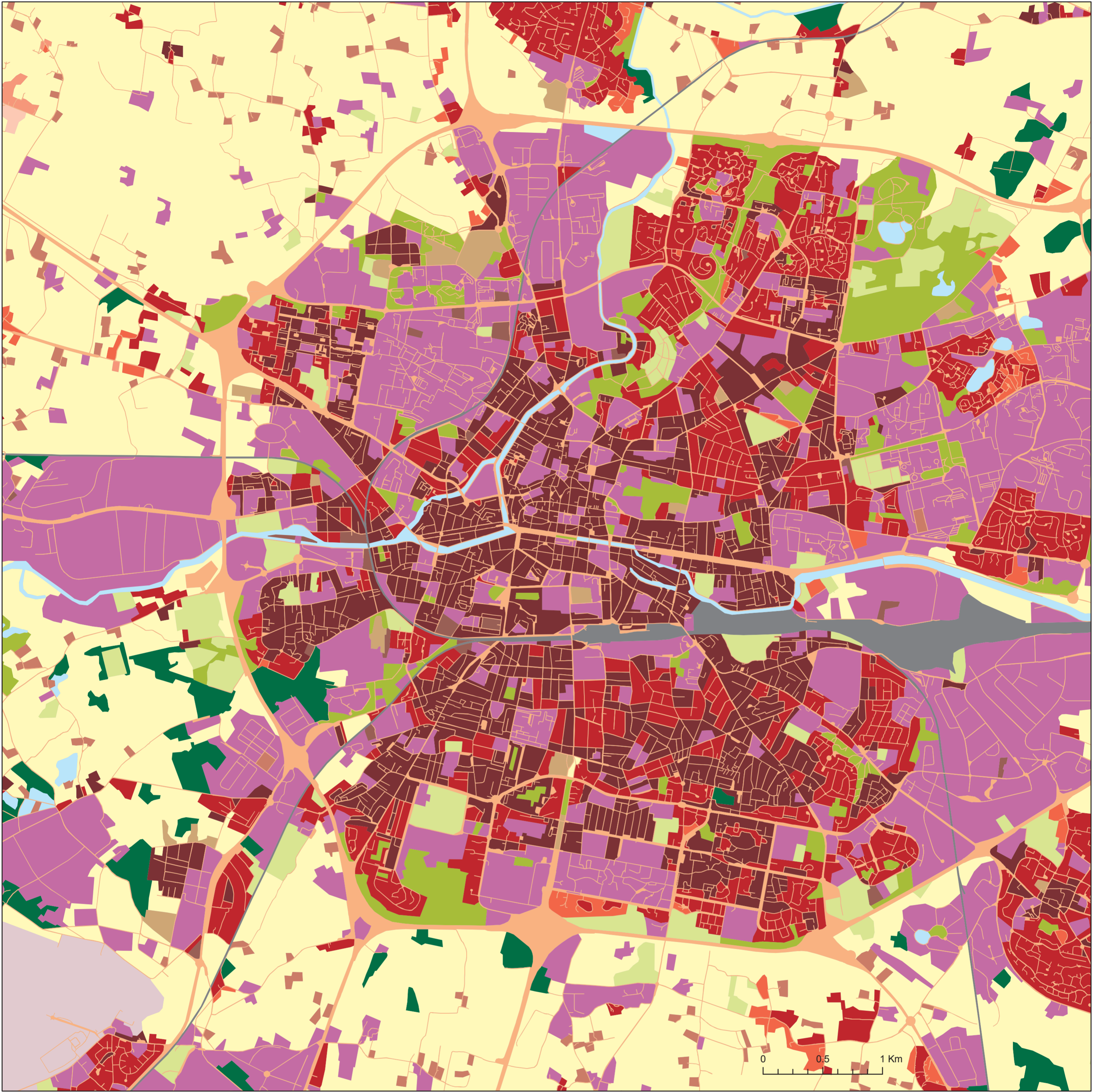
Larger Urban Zone: Rennes