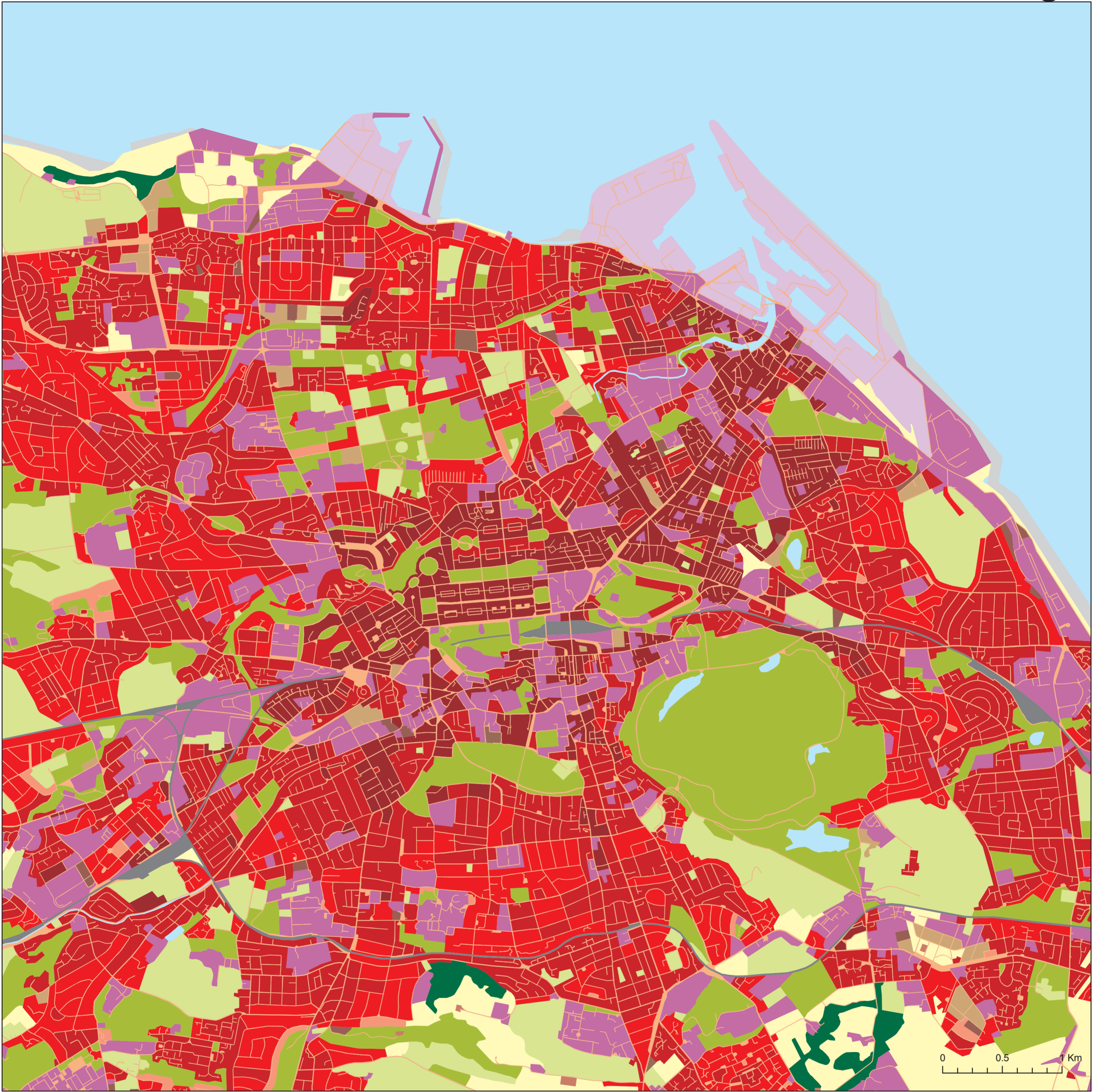
Larger Urban Zone: Edinburgh