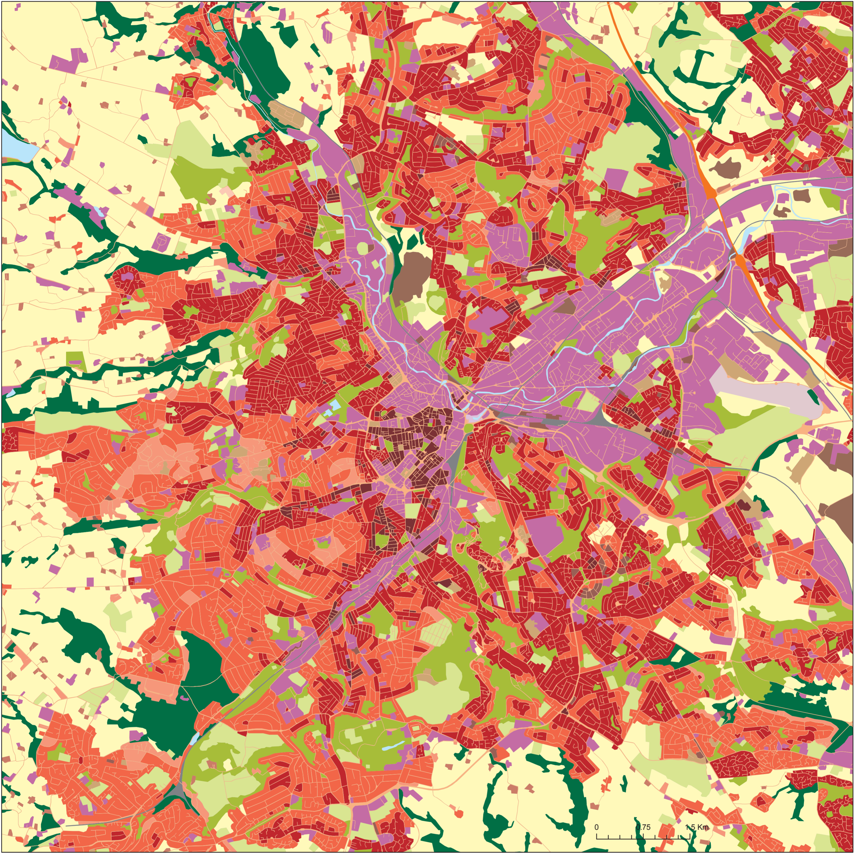
Larger Urban Zone: Sheffield