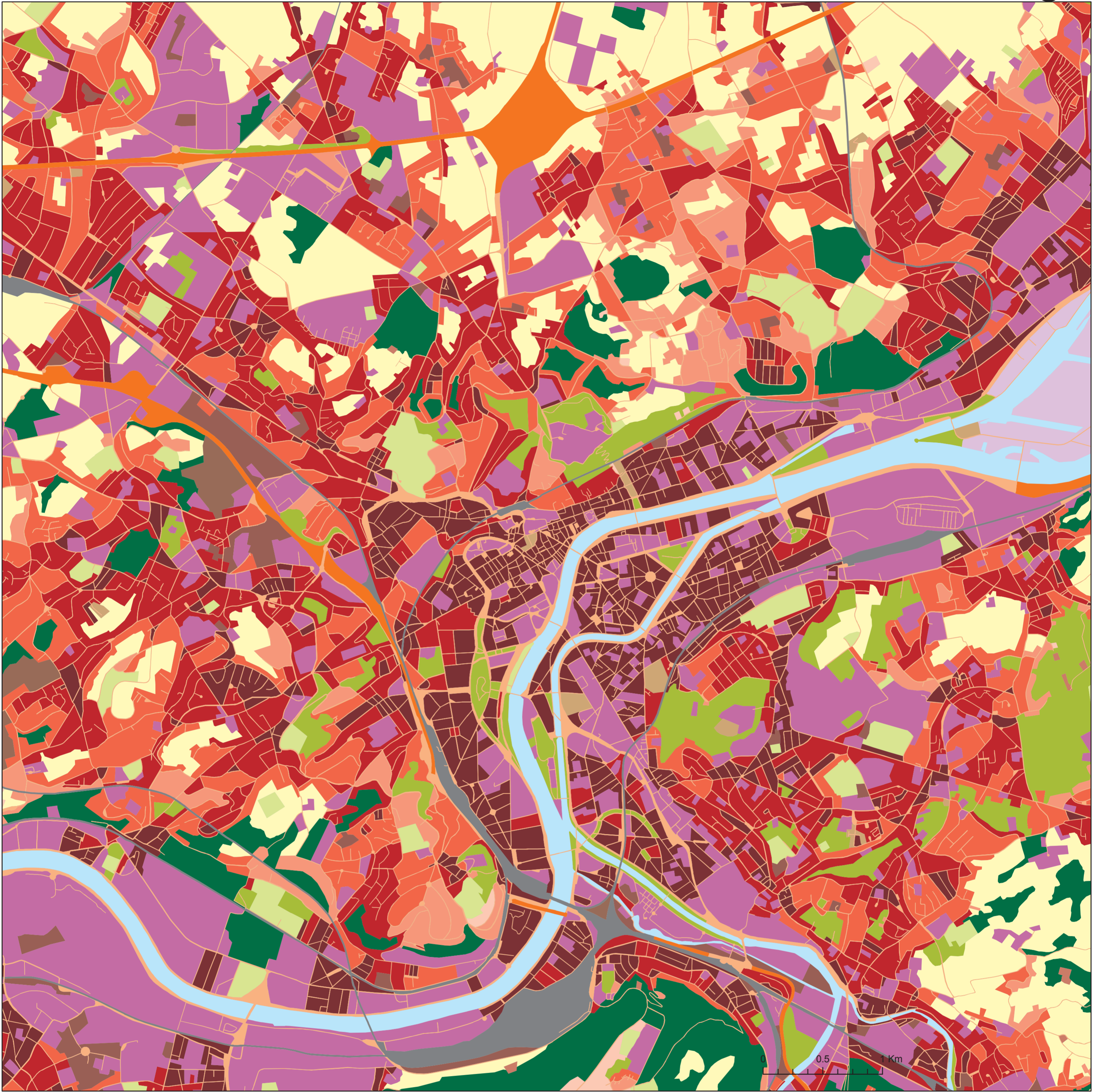
Larger Urban Zone: Liège