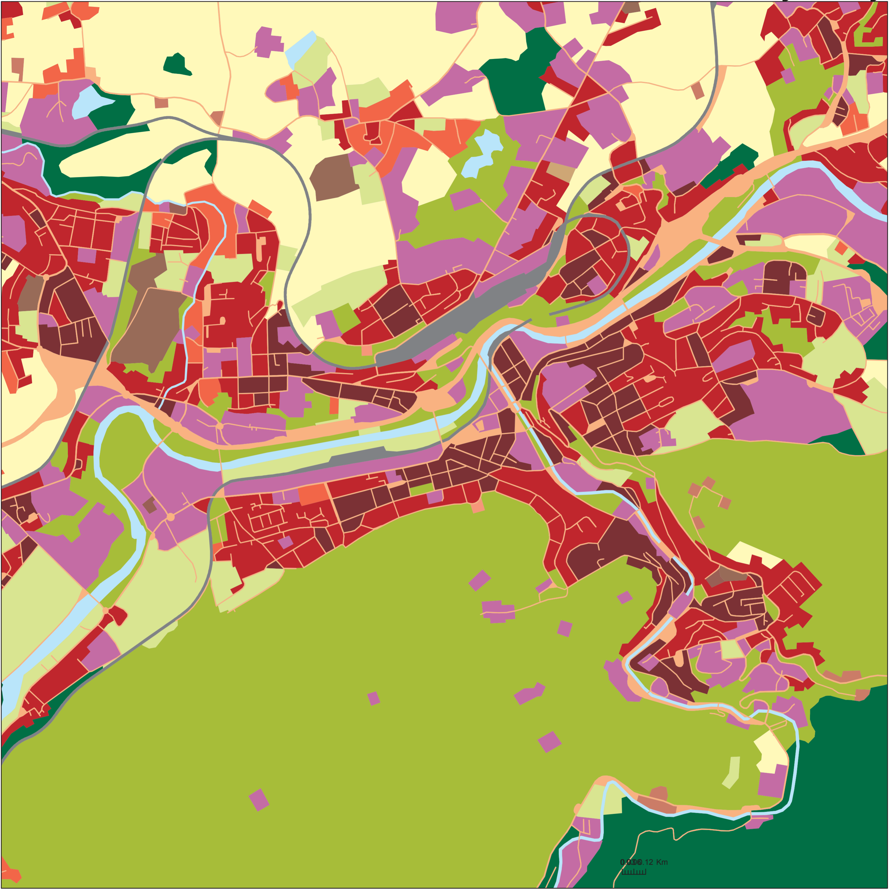
Larger Urban Zone - Karlovy Vary