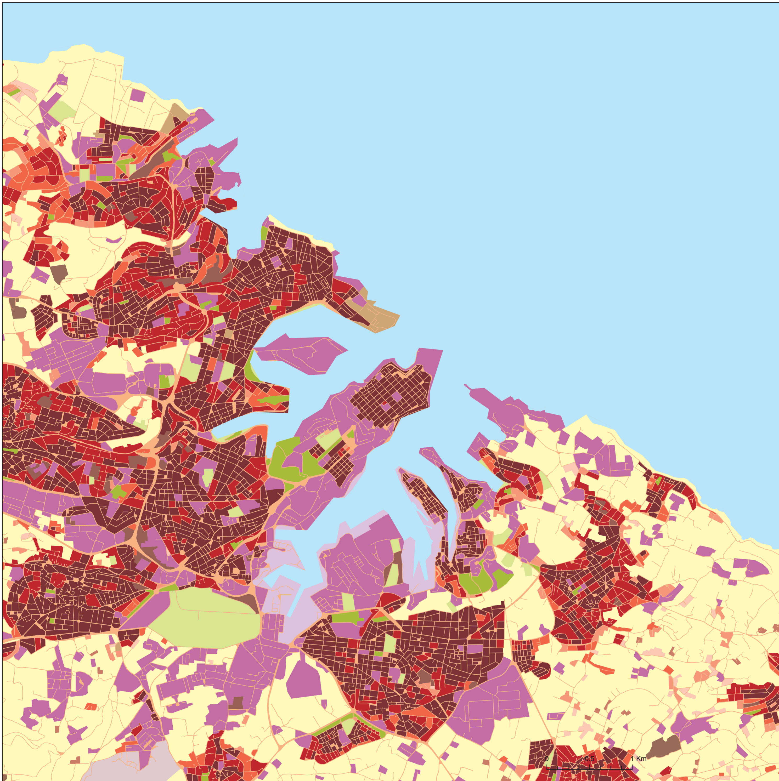
Larger Urban Zone: Valletta