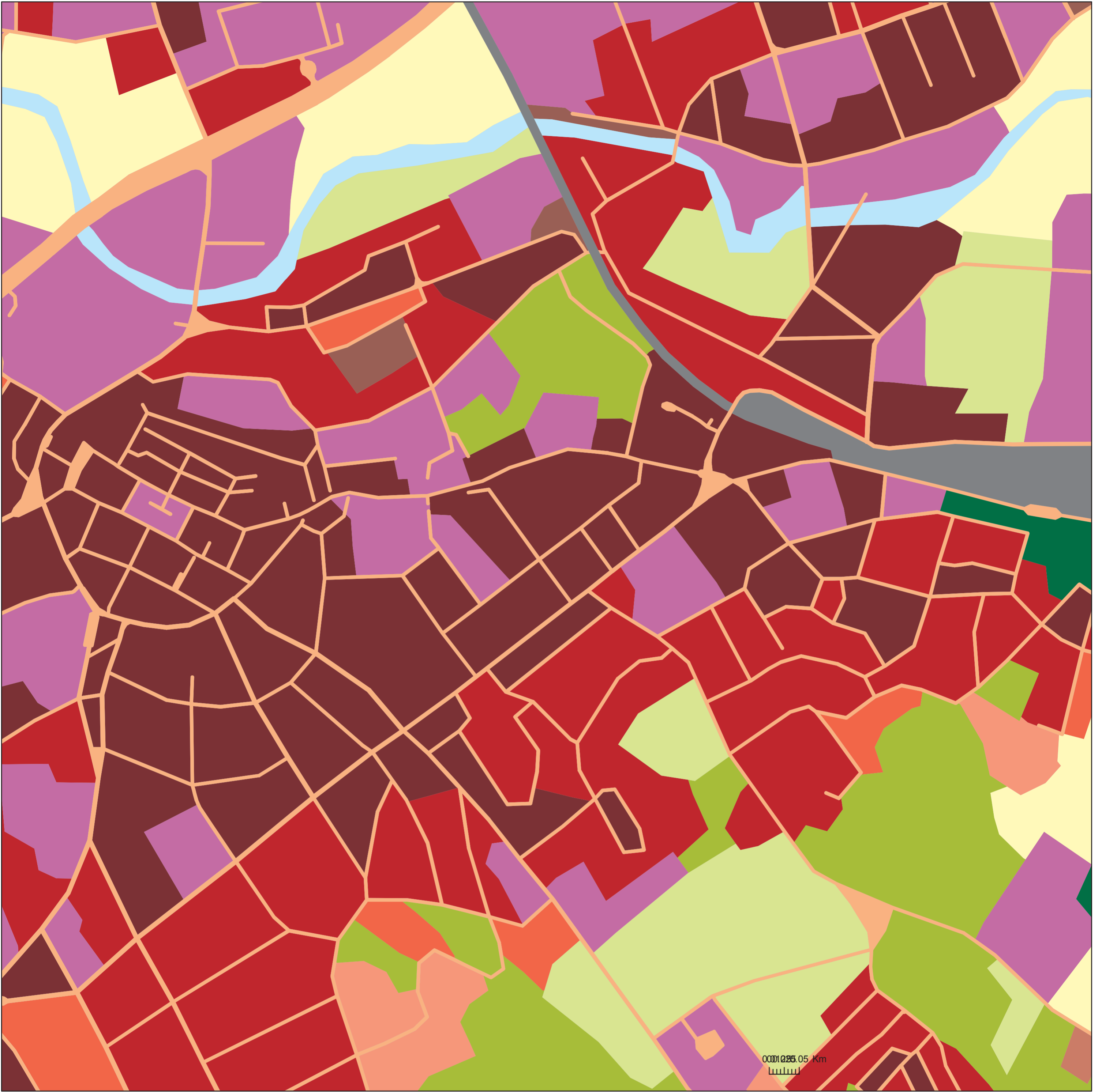
Larger Urban Zone: Jelenia Góra