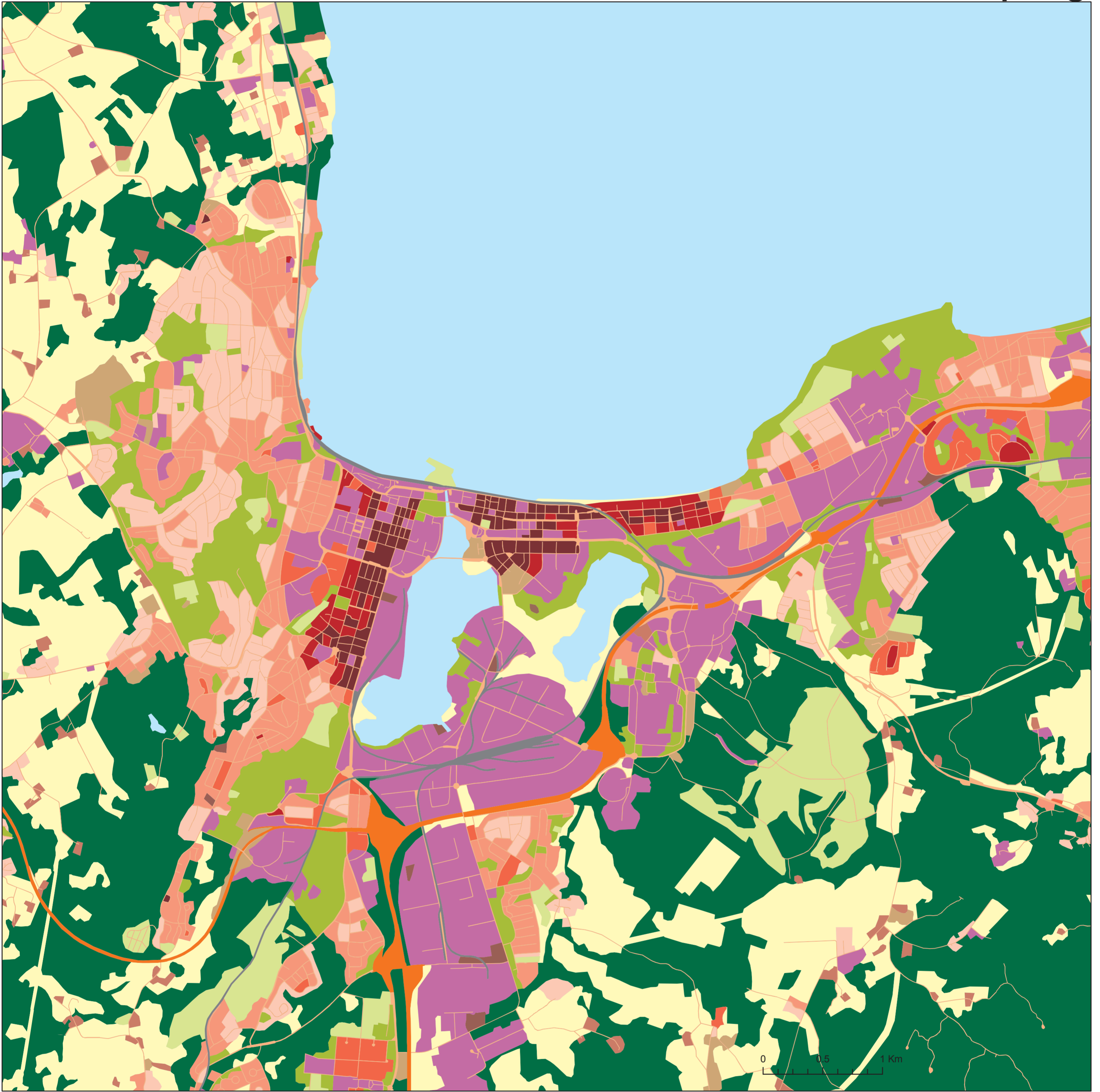
Larger Urban Zone: Jönköping