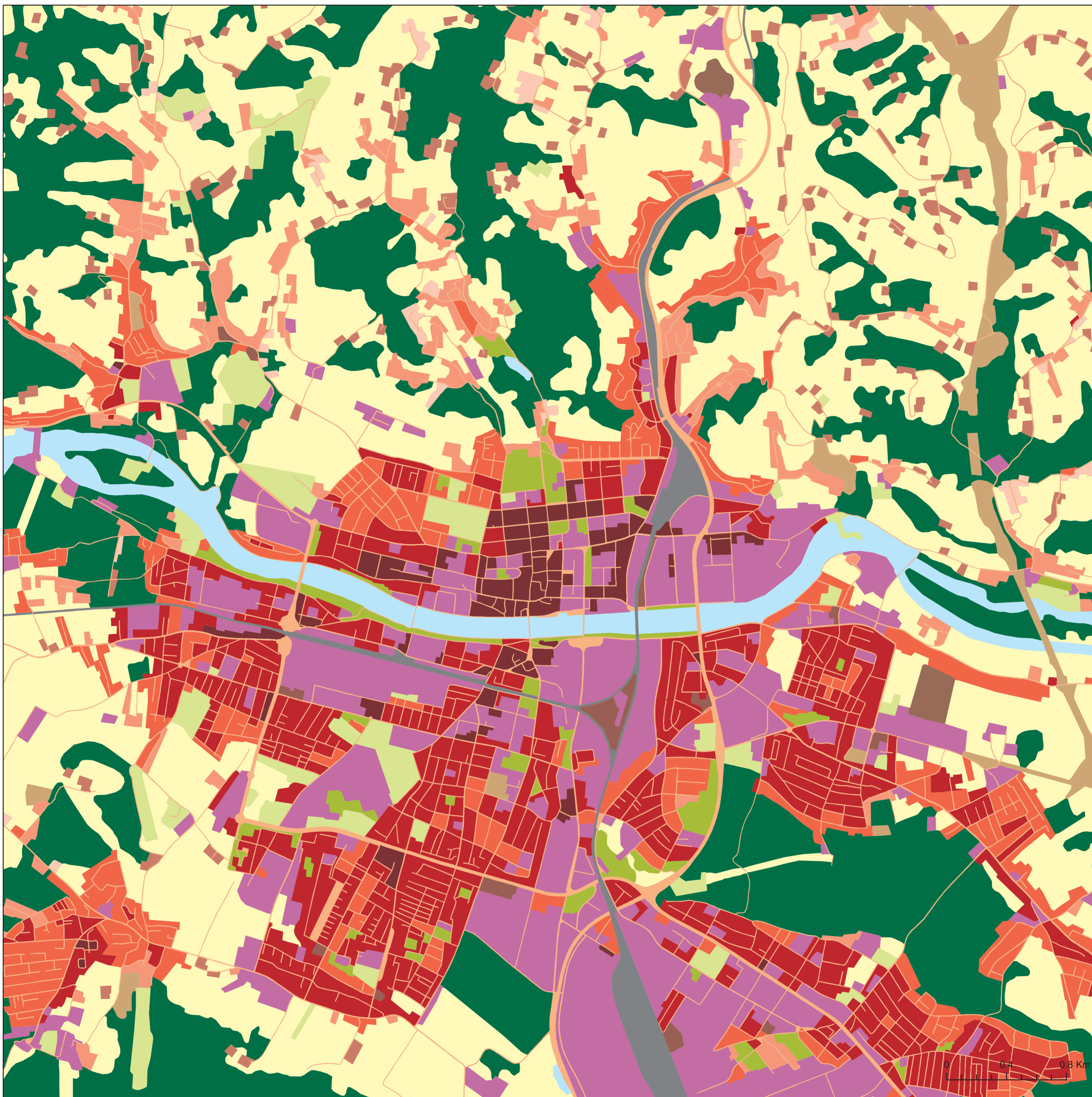
Larger Urban Zone: Maribor