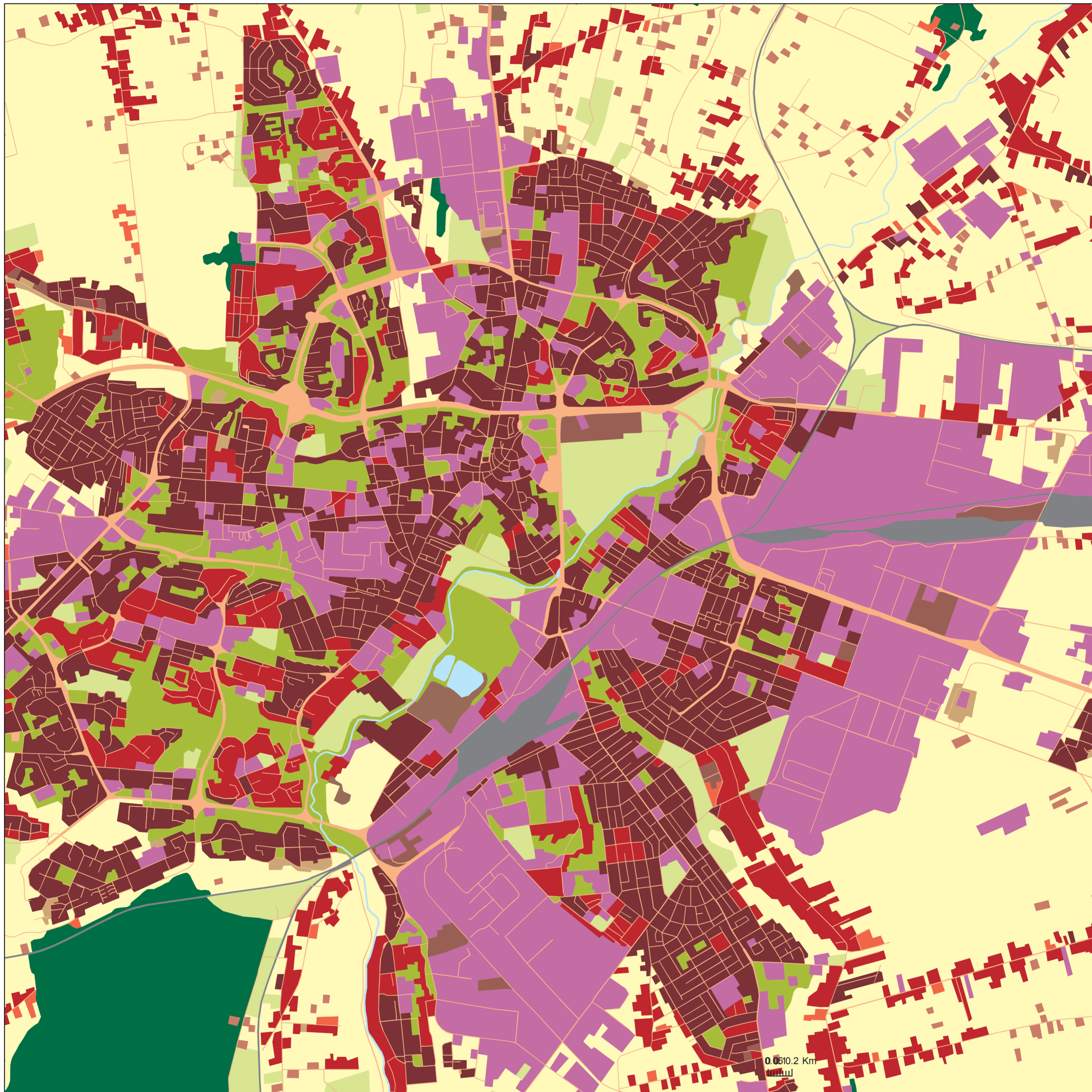
Larger Urban Zone: Lublin