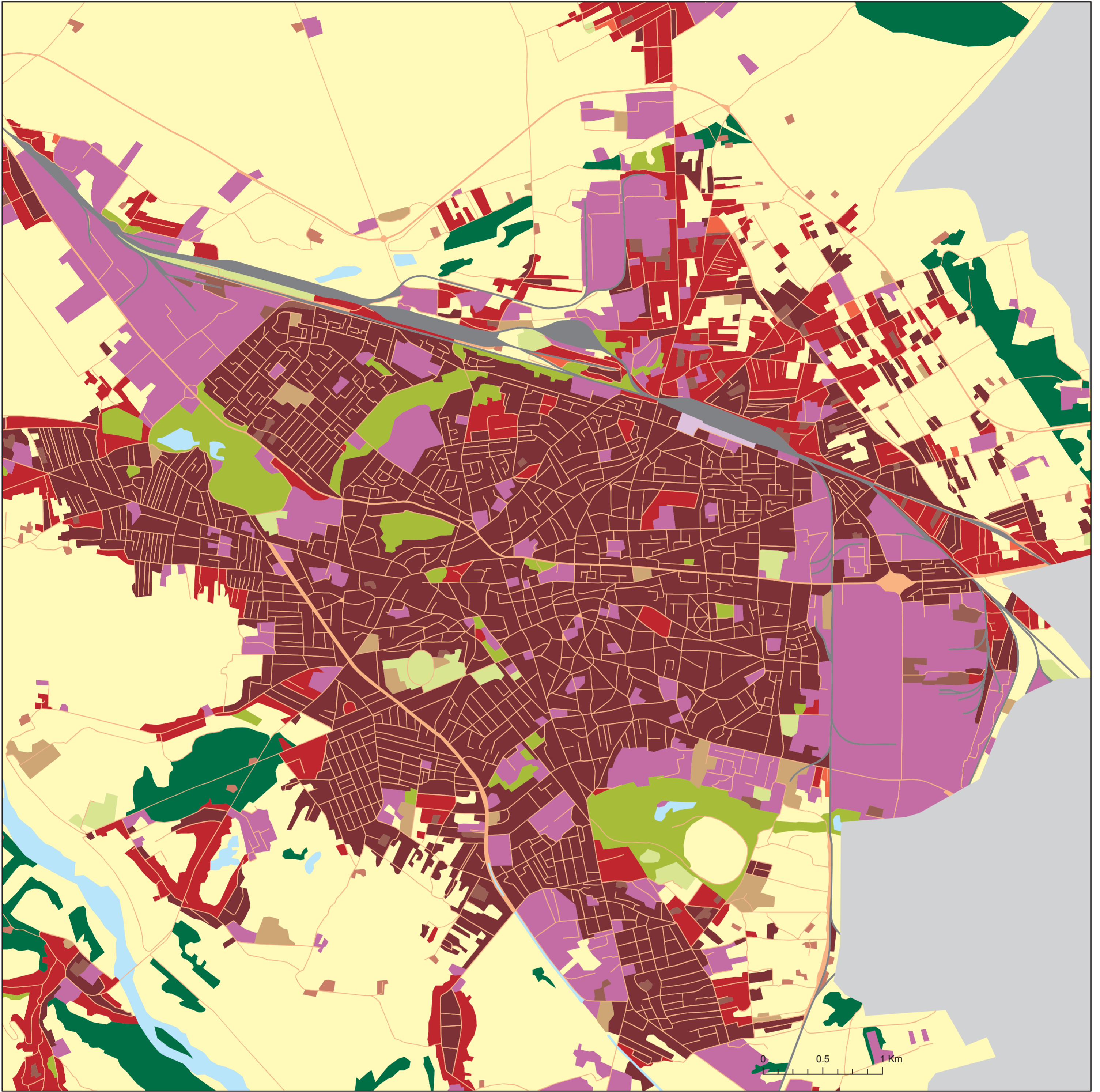
Larger Urban Zone: Craiova