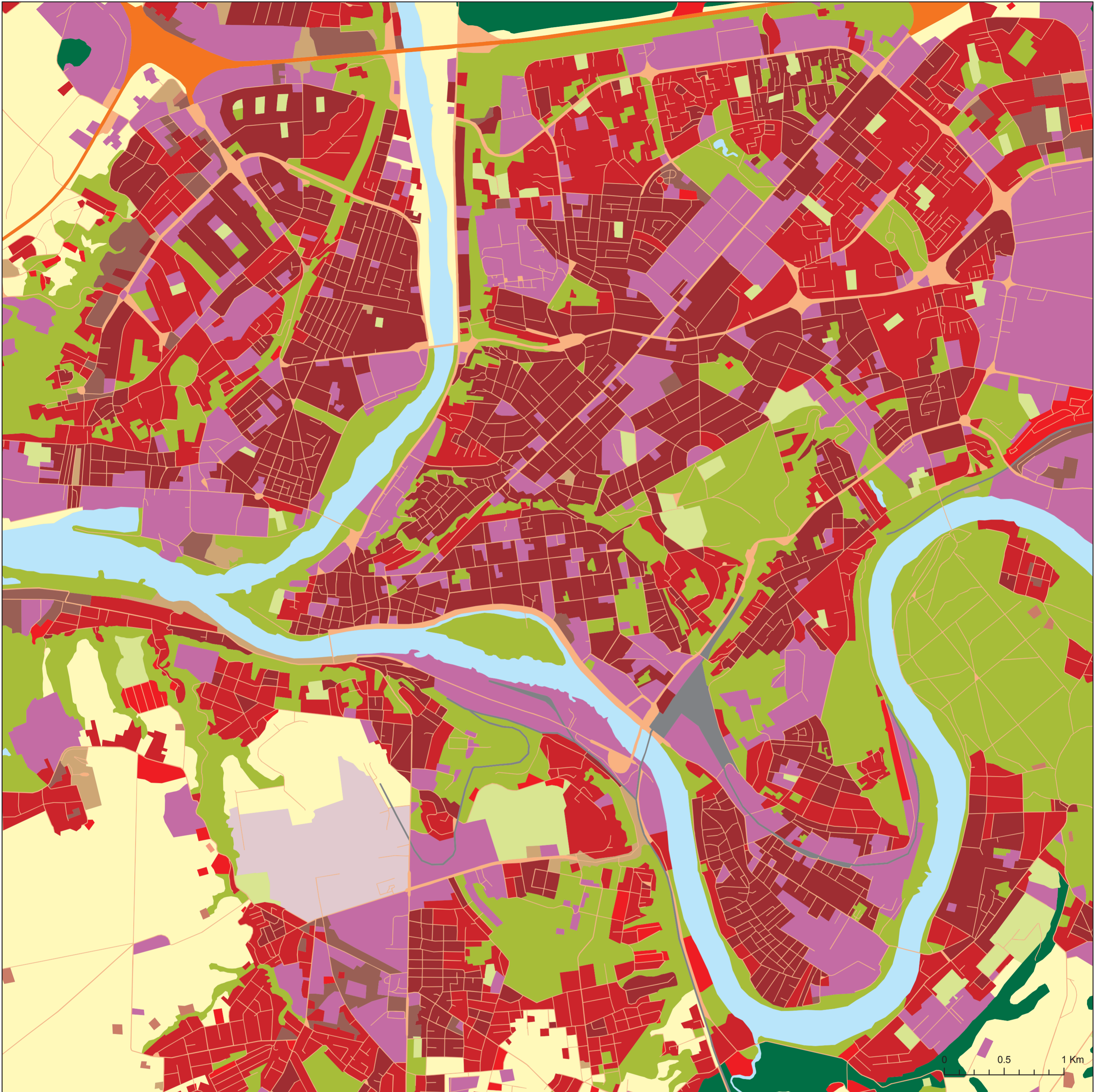
Larger Urban Zone: Kaunas