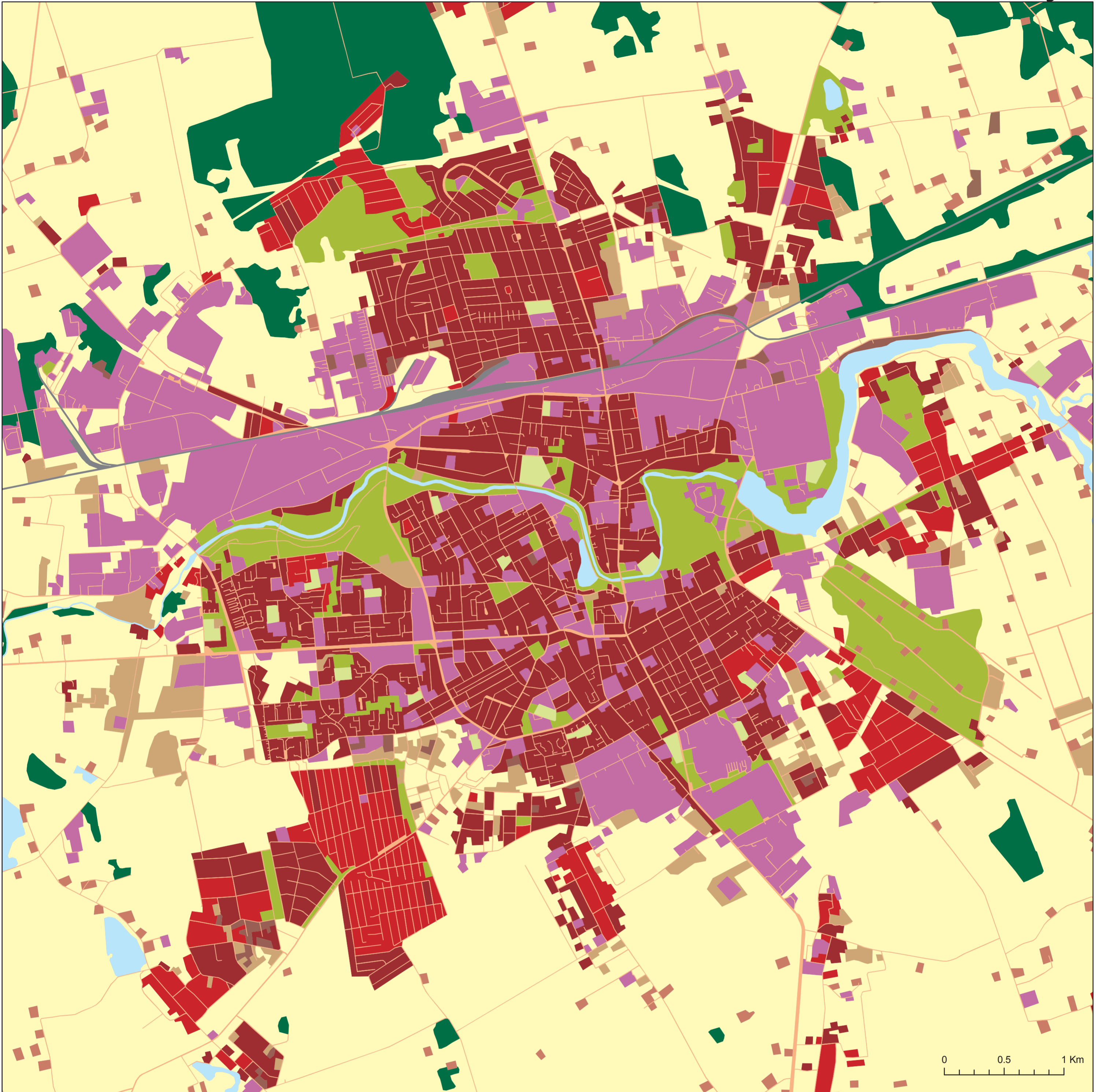
Larger Urban Zone: Panevėžys